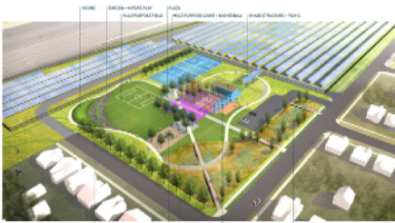
O'SHEA SOLAR INITIATIVE DETROIT, MICHIGAN